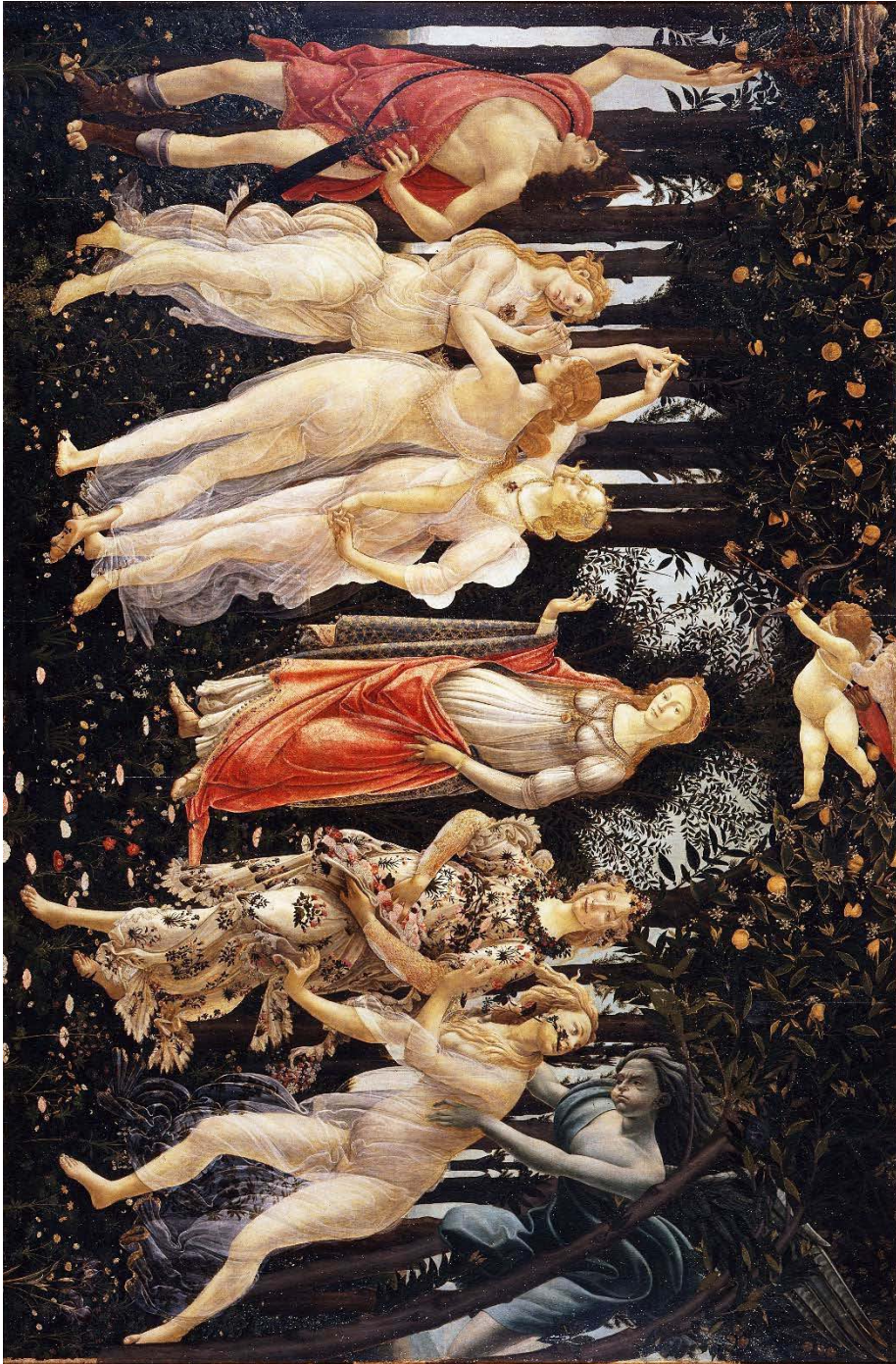
Figure 1: Sandro Botticelli's 'Primavera'