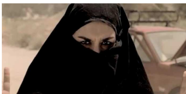
Figure 3: Cathartic moment

have done without this encounter with the US soldiers, without the assistance of the West. Even though it might look as if there is a humanizing moment of recognition when the woman’s eyes meet the soldier’s (Fig. 3) that seems to award her a certain amount of agency—her active role in diffusing the situation would speak to that—it actually is only through her that the soldier can prove to be a hero. In other words the ethnic other enables the cathartic moment for the soldier and is utilized to showcase his moral integrity.