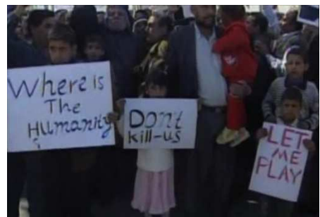
Figure 4: Gendered Stereotyping