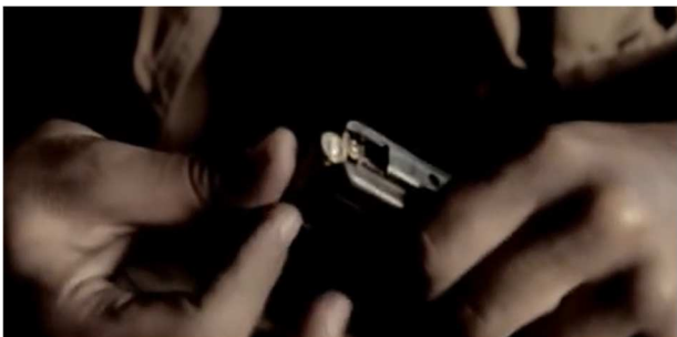
Figure 1: Establishing motive of revenge

The same method is used in the ad libitum section of the song that introduces a new musical theme and that is characterized by an increase in tempo, the repetition of phrases (e.g. "This I swear"), the growing intensity of the vocal performance and overall increase of volume. The section itself starts with the phrase 'Love is a four-letter word', a line that connotes "love" as something negative or out of place in these circumstances. Accompanied by a close-up of the protagonist's hands loading a rifle, the revenge motive is re-emphasized (Fig. 1c). In a manner that indicates male bonding and ties it directly to the terrorists, the word love is explicitly connected to the relationship between the two soldiers; and transmitted through powerful vocals. The image of the isolated protagonist loading his rifle suggests what he is willing to do to revenge his