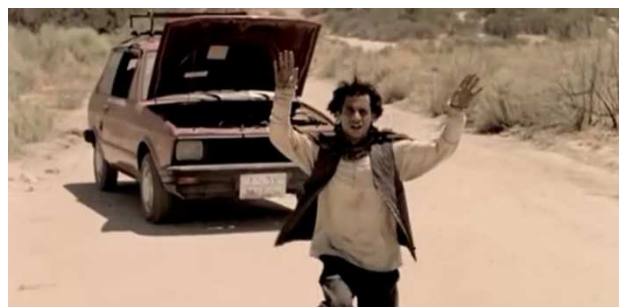
Figure 2: Symbolic powerlessness